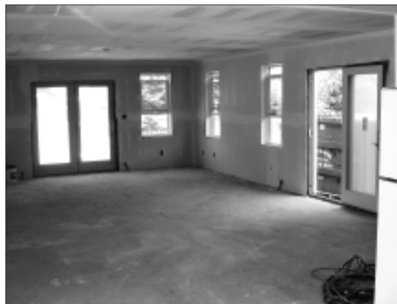
A concrete floor was poured underneath the 40x40 addition, allowing for a crawl space. The new room is built off the existing kitchen for a welcoming gathering space.