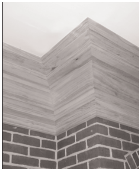
Rand Lumber provides quality lumber for custom moulding, wall panels, wainscoting and many other fine details that make a home unique.

Throughout the entire first floor of the 5,000 square foot home, Bemis’s commitment to endurance and quality is everywhere. It speaks from the long graceful windows of the living room and front room, the fireplace surround, the walls of wainscoting panels and chair rails, and nearly every windowsill and ceiling corner.