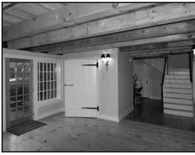
Rough hewn beams from Rand Lumber helped to combine the old with the new, paying tribute to the property's 190-year-old character.