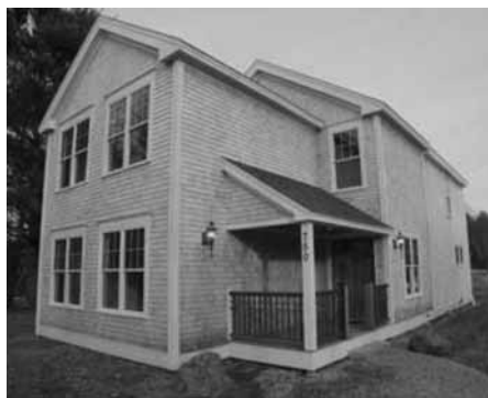
The new low-maintenance, easy-install railing system is one of the many Rand products featured in this major remodeling project.

Working closely with the whole crew at Rand, Dorothy purchased much of her wood products from us. While service was Dorothy's primary concern, she also wanted to be certain she was getting good value for her dollars spent on this large project. She shopped around for prices on many of the larger purchases and found our prices to be lower than many of the other retailers in the area.