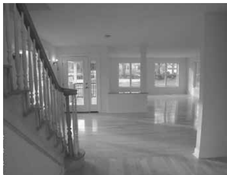
Rand provided the new stairway system for Dorothy's newly-designed spacious interior.

Rand provided all the spruce framing for the greatly changed home. We also provided all interior doors, custom extra-wide mouldings and casings, Camberra decking and low-maintenance exterior trim from Azek.