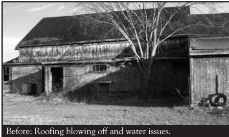
Before: Roofing blowing off and water issues.

John had already done his shopping and cost comparisons for the materials for the barn project. Rand's rough-sawn shiplap was the product of choice for the exterior. The barn renovations included a new roof, a good amount of new framing, new barnboard and new windows. Consolidating the efforts to the barn meant demolishing some buildings that were beyond repair and without future use. John assisted in the