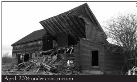
April, 2004 under construction.