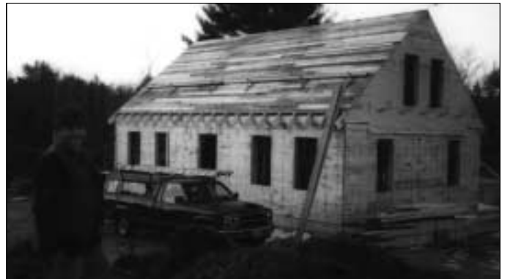
Above: Wide sheathing was used for the exterior walls. Below: Narrow sheathing from a woodpile placed close to the home is used to complete the roof.

on the first floor. This feature should prove to be a great selling tool.