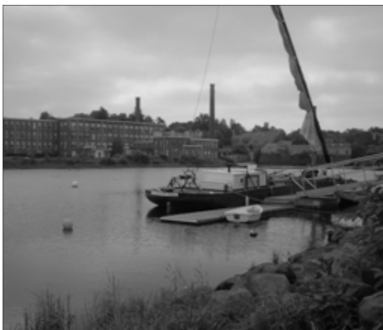
Since spring, the Adams has visited several riverfront towns in New Hampshire and Maine.

the Adams' massive lateen sail, which lies at a 90-degree angle to the deck and runs the length of the vessel.