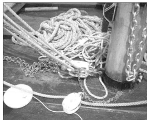
The Adams ’ stump mast was tapered to measure 14” at the base and 12” at the top.

The Gundalow Company is an independent, nonprofit organization dedicated to preserving the Captain Edward H. Adams and providing a platform for maritime, historical, social, and environmental education on and about the waters of the Piscataqua Maritime Region. For more information, please visit www.gundalow.org .