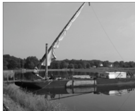
In 1982 Rand Lumber provided several large timbers that were required for a traditional reproduction of the only remaining Piscataqua Gundalow.