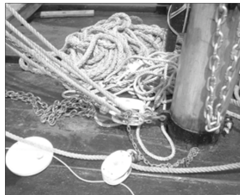
The Adams ’ stump mast was tapered to measure 14” at the base and 12” at the top.

The Gundalow Company is an independent, nonprofit organization dedicated to preserving the Captain Edward H. Adams and providing a platform for maritime, historical, social, and environmental education on and about the waters of the Piscataqua Maritime Region. For more information, please visit www.gundalow.org .