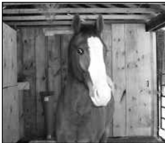
The Prince of Jacks will celebrate his second birthday in a spacious new barn.