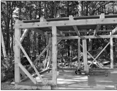
Timber provides structural strength and integrity in contemporary stud-frame and traditional post and beam construction projects.

When used on concrete flooring, the result is a very solid construction perfect for Walker's shed, which will be used as storage and for a workshop.