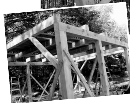
Top: Diagonal bracing is used in the framework to provide support for the entire structure, removing the need for interior load bearing walls.