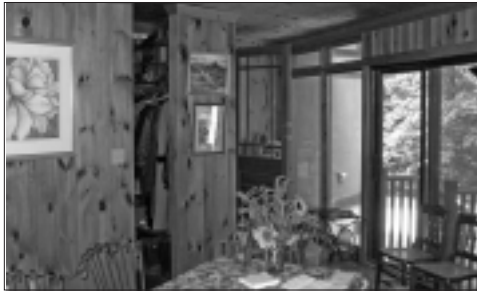
The sunny "connector" room hangs between the original structure and the new addition.

that to Gregory's view, captures the essence of the Midwest. "Having a porch was always part of the plan," he notes, pointing out the edge-and-center bead ceiling boards capped with crown