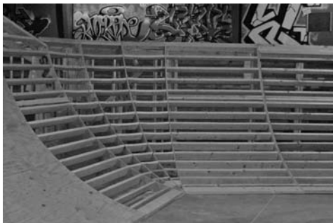
Bowed corners of the skateboard park's "bowl" design require multiple compound cuts and beveling of the wood.