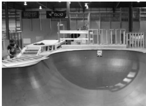
One of the pockets in the park's Clover Bowl was built with two bowed corners..