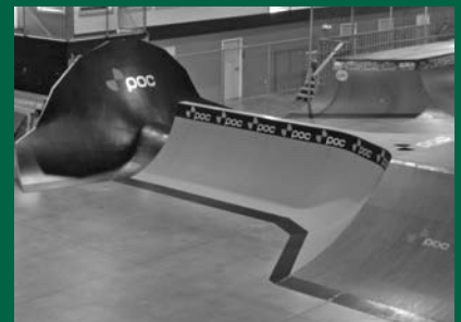
Rye Airfield's new Hip-Spine-Roller ramp was built with materials from Rand Lumber.