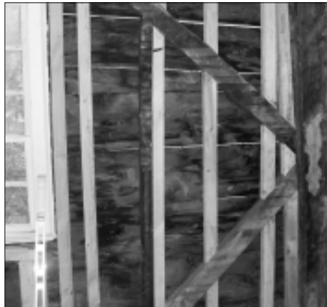
Sistered studs: Cured hemlock studs are sistered with the existing wall supports.

Around 50 years after the house was constructed, the homeowner was away in Canada fighting in the French and Indian War when American Indians took advantage of the entrance to invade the home and murder the soldier's wife and two children.