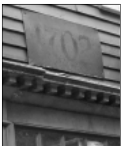
The character of the 1702 home is being carefully preserved by Old House Restoration, West Newbury, Mass.

We recently supplied Ed with a variety of materials for a 4,500-square foot colonial that he's been renovating in Merrimac, Mass., since January. In the historic four-bedroom home, built on the waterfront in 1702, the original owner had smuggled freight directly from the river through a tunnel in the basement in order to avoid paying taxes. The wide brick tunnel has been filled in, but its outline remains visible today.