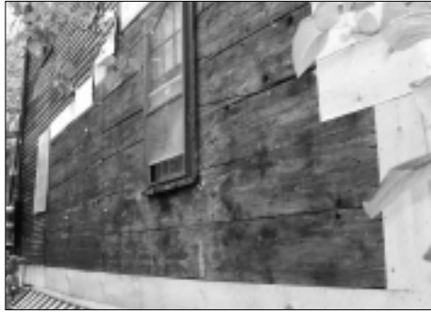
Outside, our rough-sawn sheathing underlays soon-to-be-replaced wood siding.

He concludes, "I love doing this type of work and I'll have Rand follow me to all my jobs from now on."