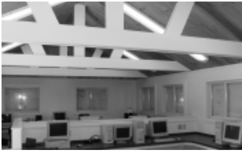
The ceiling of the camp's new computer lab shows off our VMatch pine.

"The camp is very sports oriented, and the kids tend to come in here with their cleats still on. These floors take a beating but the hemlock holds up great."