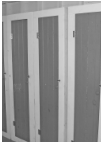
Top Left: Pre-primed edge & center bead makes work on lockers and cabinets go much faster. Top Right: "Bunk 4" at Camp Bauercrest is one of several bunkhouses that have been remodeled with quality materials from Rand Lumber. Right: Hemlock flooring matches the original material used in all of the bunkhouses.

Our novelty siding, planed on four sides with tongue and groove edges and a scallop on one side, provides Leon with a traditional alternative to clapboards. "It was used when the bunkhouses were first built 70 years ago," he notes, "and it matches up perfectly so we can keep that same look."