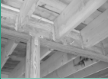
Triple-laminated wood beams

A triple-strength beam running down the center of the building compensates for structural support that was sacrificed by replacing the standard three post design – a practice that would have left one post located smack in the middle of the garage. Even the side access door swings to the outside, instead of the standard inward swing. "Why bang up your car?" asks Bob. "This makes a lot more sense."