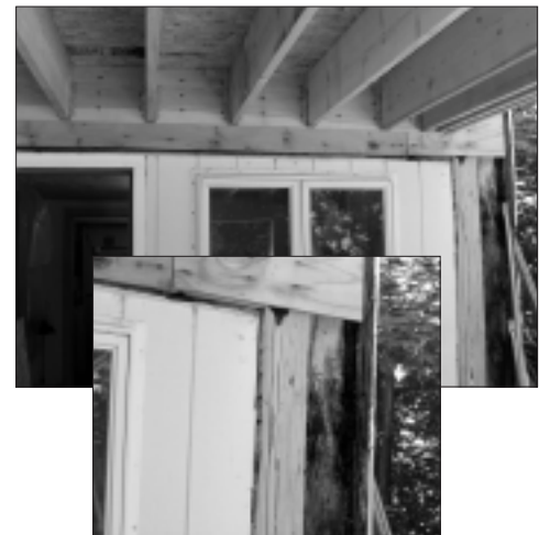
Left: The tusk tenon is also called a keyed tenon or wedged tenon. Middle: Kelso pre-finished the 2-inch by 6-inch tongue-and-groove boards for longer lasting and more uniform aging. Right with inset: The newly installed LVL beam takes some of the weight off the original corner beam, which had been rotting under house wrap.