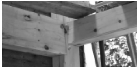
Ceiling joints are pinned together with hardwood pegs to stay tight and strong for generations.

First, for the ceiling rafters, Kelso made tusk tenons—a mortise and tenon design that features a wedge-shaped key to hold the joint together. The tenons sit in a pocket (the mortise) and are notched in inch-high increments. Not only does the key provide added strength and stability to the joint, but because the timbers are green—and therefore likely to shrink over time—the tusk tenon does not reveal the shrinkage.