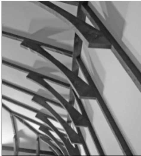
Close-ups of beams: Rough lumber was used for the rafters and studs, and stained to match the original boards.