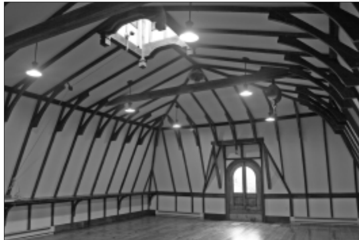
The cupola was also rebuilt with lumber from Rand. Its windows are controlled remotely today, while in the 1870s they were lifted by ropes with the aid of pulley wheels.

Beginning in the downstairs, Homesmith insulated and reinforced the floors, then installed and stained a ceiling of rough-hewn pine boards to