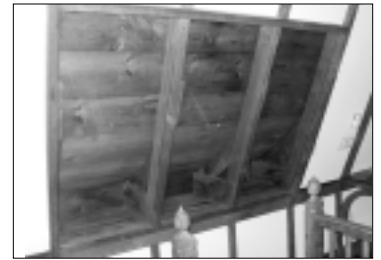
The unique history window shows hay counts from 1885.

insulation and drywall, then rough lumber over the original rafters and stud locations, which they stained to match the old.