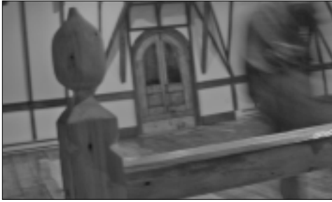
Required by present day building codes, the guardrail was added during the renovation and designed and built to look original.

the actual lumber yard. "Rand really knows its lumber from top to bottom," he says, "and the prices were great. I would definitely use Rand again for another project."