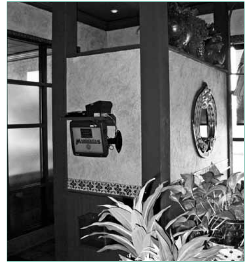
Inside, our one-by-eight rough cut was used to create beams and shelving for wait stations and other partitions.

We are proud to have the loyalty of the Margaritas team and to know that our products are being used to help this positive family-owned company continue with its success.