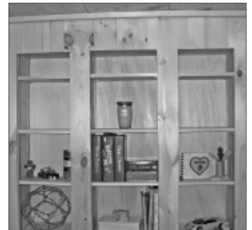
Left: Angled boards follow the upward lines of the stairway. Center: A hidden panel tucked under the TV stores remotes and other everyday items. Right: Built-in shelves offer the BarTERS plenty of storage for the kids' games and toys. Inset: A slatted door keeps the Barter's curious dog away the speakers in the entertainment center.