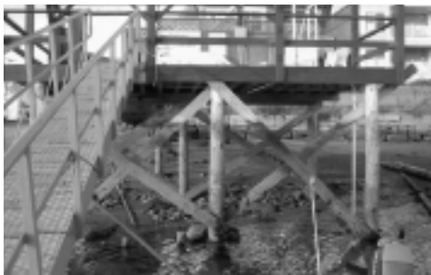
The first pier rebuilt using Rand Lumber's pilings and large timbers