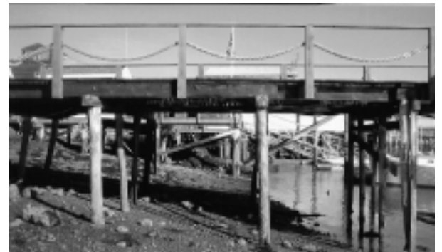
Photo of old piles/pier, ready to fall apart