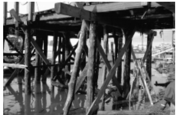
After new timbers were installed