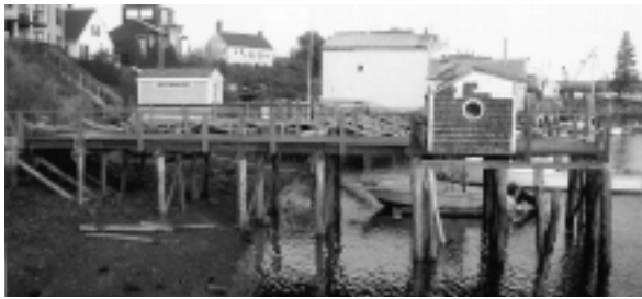
Final completion, showing rails, piles and main cross timbers, all from Rand Lumber (old pilings are laying on ground to the left).

the reconstruction could possibly make it the longest pier running parallel to the Piscataqua River in the town of Kittery, Maine. The new pier will also help stabilize the 30 boat slips in the strong currents of the river. Darren also completed restoration to one of the few 100-ton railway on the