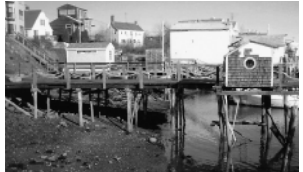
2007 Far pier prior to major rebuild

Aside from the success of completing the piers, there are also a couple of notable facts that go along with the project: Once the last pier is complete,