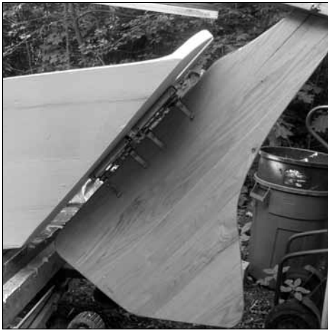
A cut-out in the six-quarter oak accommodates the rudder.

The name of the boat will be Solution – a way of acknowledging that there’s always a way to solve a problem, or that getting out on the ocean is like a “solution” to getting away from the everyday ups and downs that we all experience.