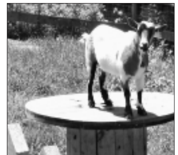
Left: The shed off the back of the barn provides an additional eight feet of storage. Top Right: Livestock will enter and exit the new barn from their own door on the side. Bottom Right: A future resident of the Allens’ Kittery Point barn.