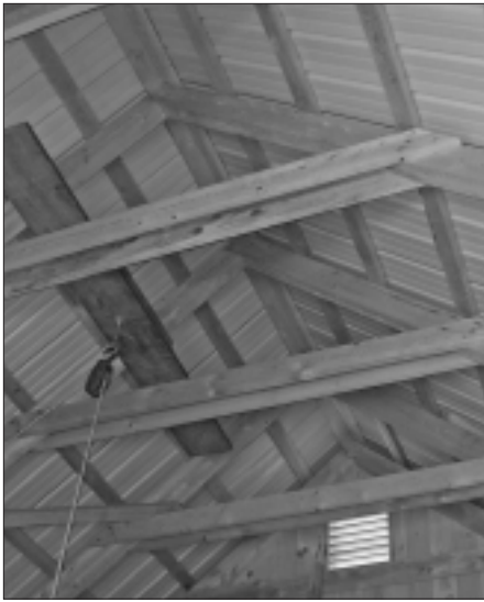
The barn is framed with hemlock.

manages to stay true to its roots. That's unique in a day of the big box stores."