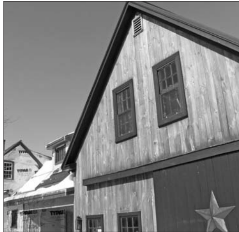
The main house and barn will be tied together with a variety of siding and roofing materials.

Significantly more than a breezeway, the addition includes many unique aspects such as a catwalk that will span across the main living space to join the master suite with the two-bedroom house. A multi-level design requires two to three steps at the entrance of each room. And with the various sized rooms also situated at angles to each other, a feeling of transition and arrival will provide impact upon entering each one.