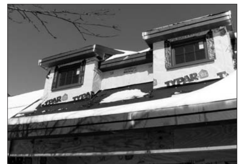
Rand provided rough sawn lumber for outside details such as the two dormers on the front of the house.

“I had never worked with Rand Lumber before, and I knew they were convenient for jobs we’ve done around the Seacoast,” he says, “but after my experience on this project, I will not hesitate to use or recommend Rand again.”