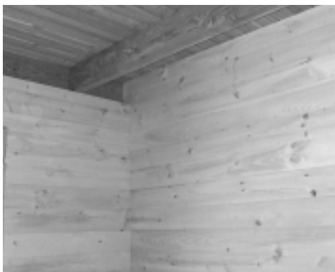
Rand supplied the the rough-hewn pine used in the stalls, custom cut with a band saw.

"Most lumber yards won't call and ask how the product worked out. Maybe it's a carryover from years ago when you always had that personal relationship, but since the Rand family grew up in the business, I think it's ingrained in them. Product quality can be the same between lumber yards, but it's the service that separates the companies apart."