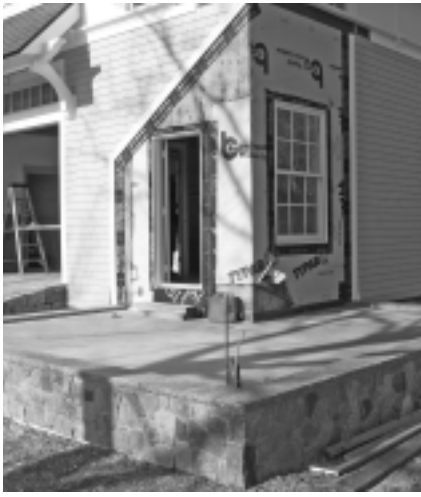
A greenhouse will be built off the side of the barn. A radiant heating system is built into the concrete slab.