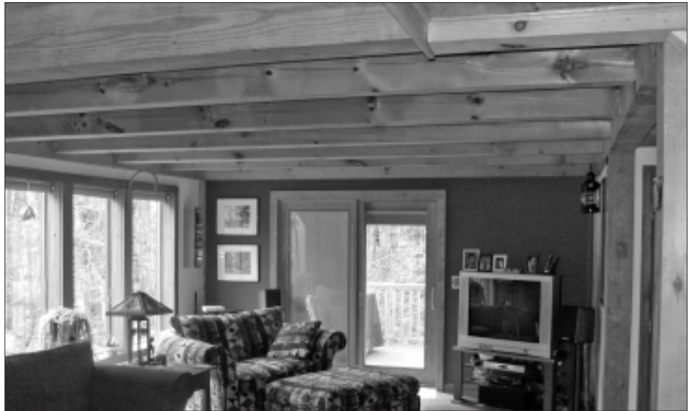
Top: Plenty of window access to the outside adds to the natural feeling of the post and beam.