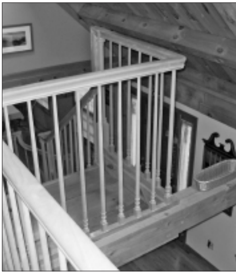
Exposed beams combine with the beauty of wood details.