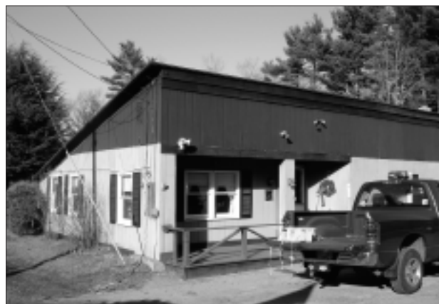
The original building was an open garage used by the town to park its trucks. The Walker family enclosed it in the 1970s for use as a home; today the single-story ranch addition brings another Walker generation close by.

Like strong New England families, Rand Lumber’s commitment to quality and service continues to endure.