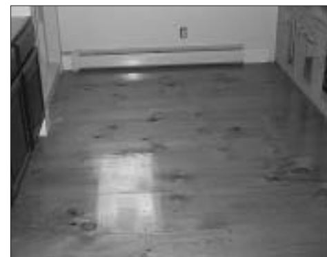
Rand Lumber helped determine how many linear feet of random-width floor boards would be needed throughout the Hendersons' 1738 colonial Saltbox reproduction.