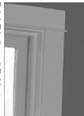
Rand also supplied the materials for detailed moulding that encases the Hendersons' over-size windows.

"The first thing that people notice and see and stop and look at when they walk in this door... is the floors."