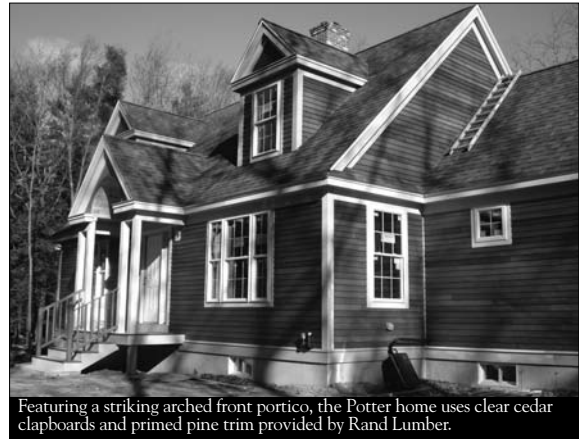
Featuring a striking arched front portico, the Potter home uses clear cedar clapboards and primed pine trim provided by Rand Lumber.

All together, these types of services demonstrate the difference between Rand Lumber and other companies.