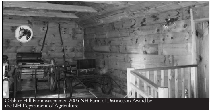
Cobbler Hill Farm was named 2005 NH Farm of Distinction Award by the NH Department of Agriculture.