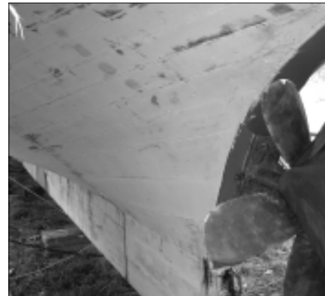
Mahogany planks of varying lengths will replace the rotted sideboards on the Gone with the Wind . Part of the transom, or stern, was full of rotted oak.

"When it comes to enduring classics, there's no higher standard than Gone with the Wind ."