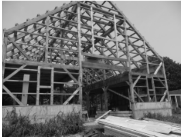
The skeleton of the Brewer's stacked post and beam constructed barn.

As much of the seacoast grows in building condos and other buildings not seen a century ago, one builder is creating a barn that could have been situated in Rye in almost any century. Jon Bailey is building a traditional, stacked post and beam barn in Rye for the Brewer family and their many livestock. A stacked post and beam construction was chosen, as the barn could be assembled quickly and less expensively than a traditional post-and-beam construction. The end result is just as sturdy and beautiful as a traditional post and beam barn. When complete, the barn will house the family's goats, pigs, turkeys and chickens, all of which are currently living in a series of other smaller